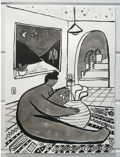
Lady holding a plant with stairwell, 2019 sumi ink on arches 18x26