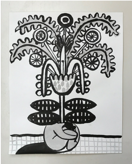
Big Bloom with lady in vase, 2019 sumi ink on arches cold press 16x20 inches