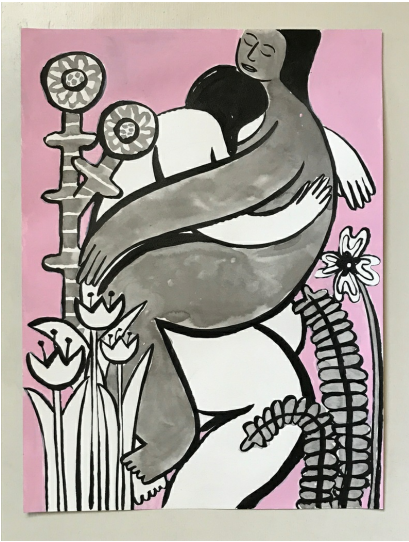
Lady comfort in flowers with pink, 2019 sumi ink and acrylic on arches cold press 18x24

sleep, I dream of times when we were close; times in the future when we may come back together. And sometimes, what is real in my mind is more real than what is actually going on outside.